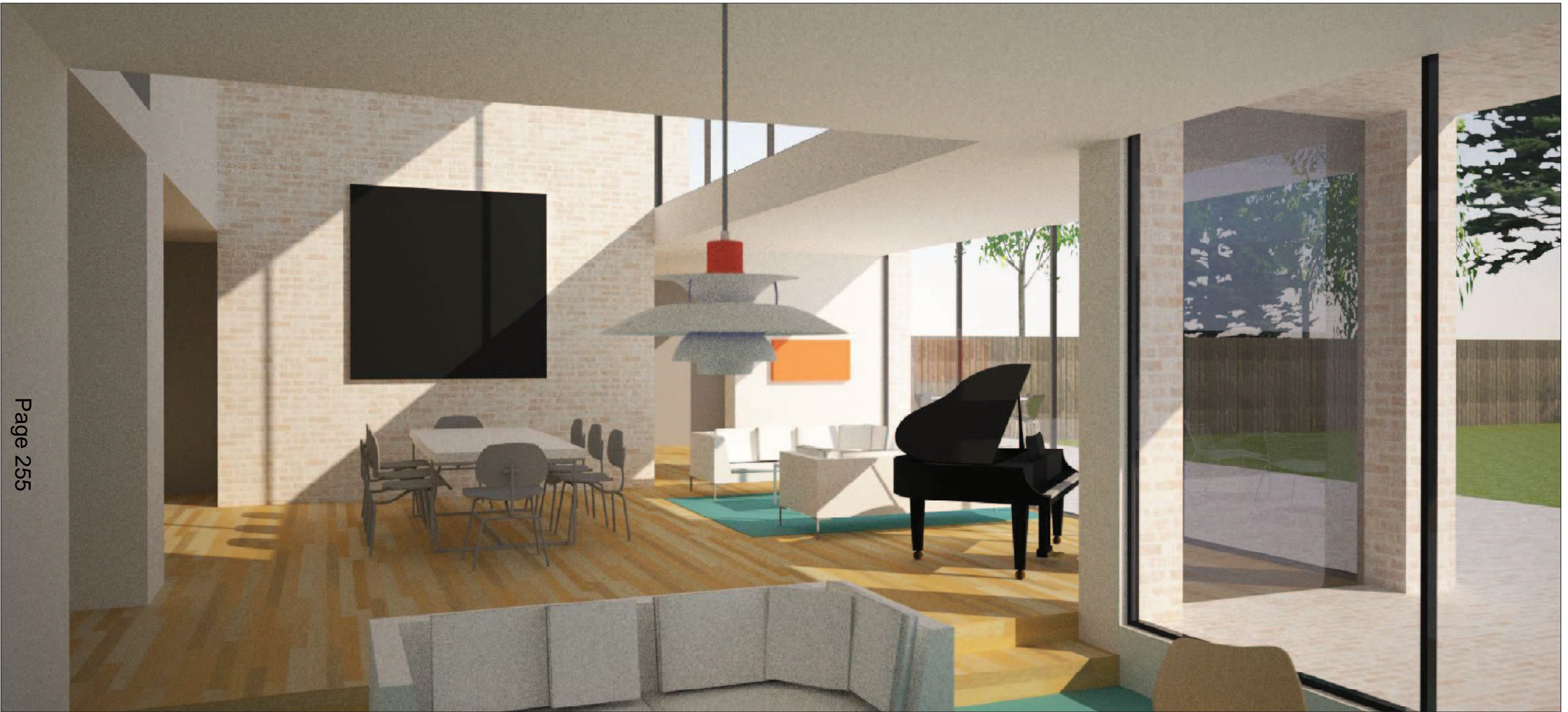
INTERNAL VIEW THROUGH MAIN LIVING ROOM