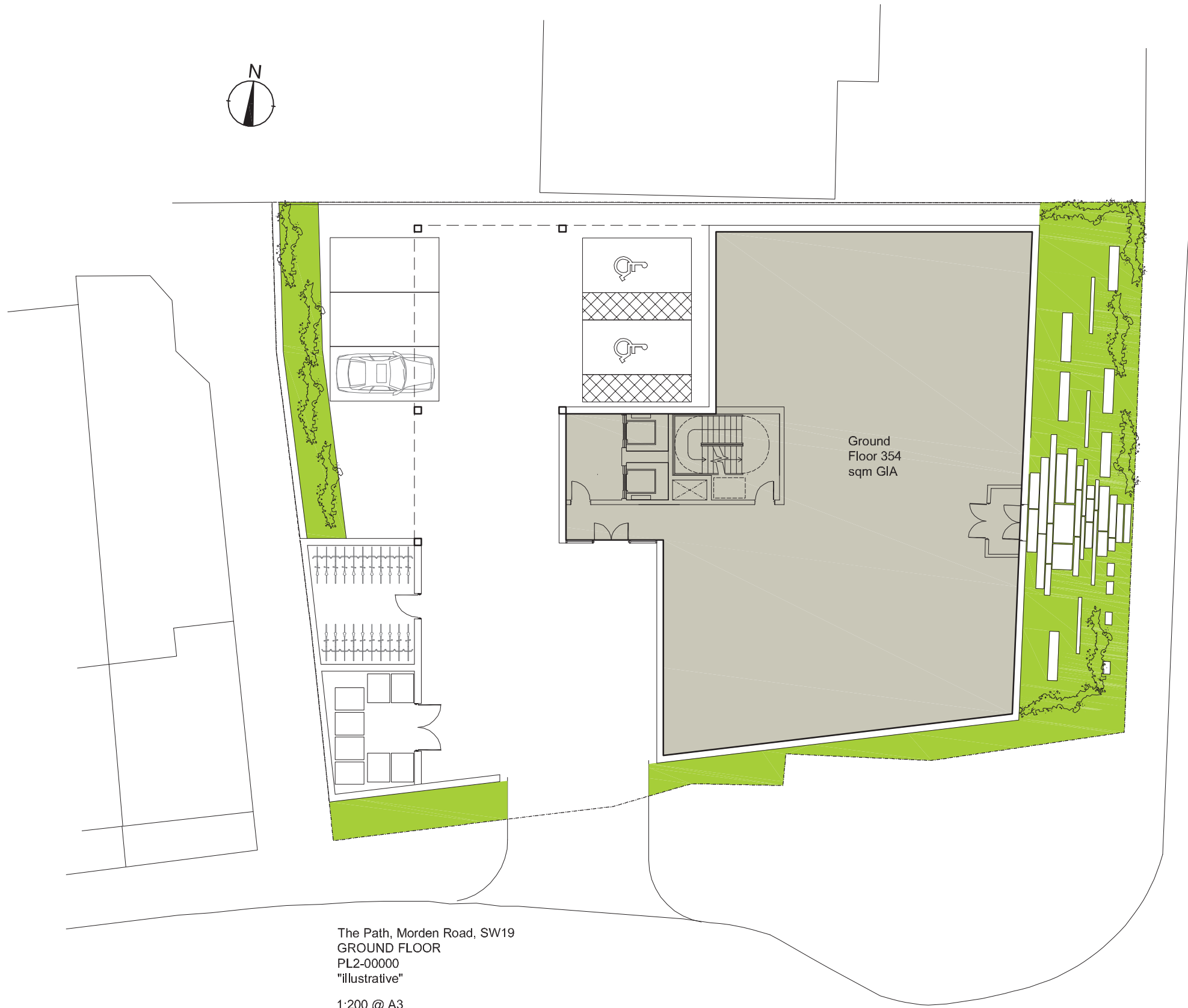
The Path, Morden Road, SW19 GROUND FLOOR PL2-00000 "illustrative" 1:200 @ A3