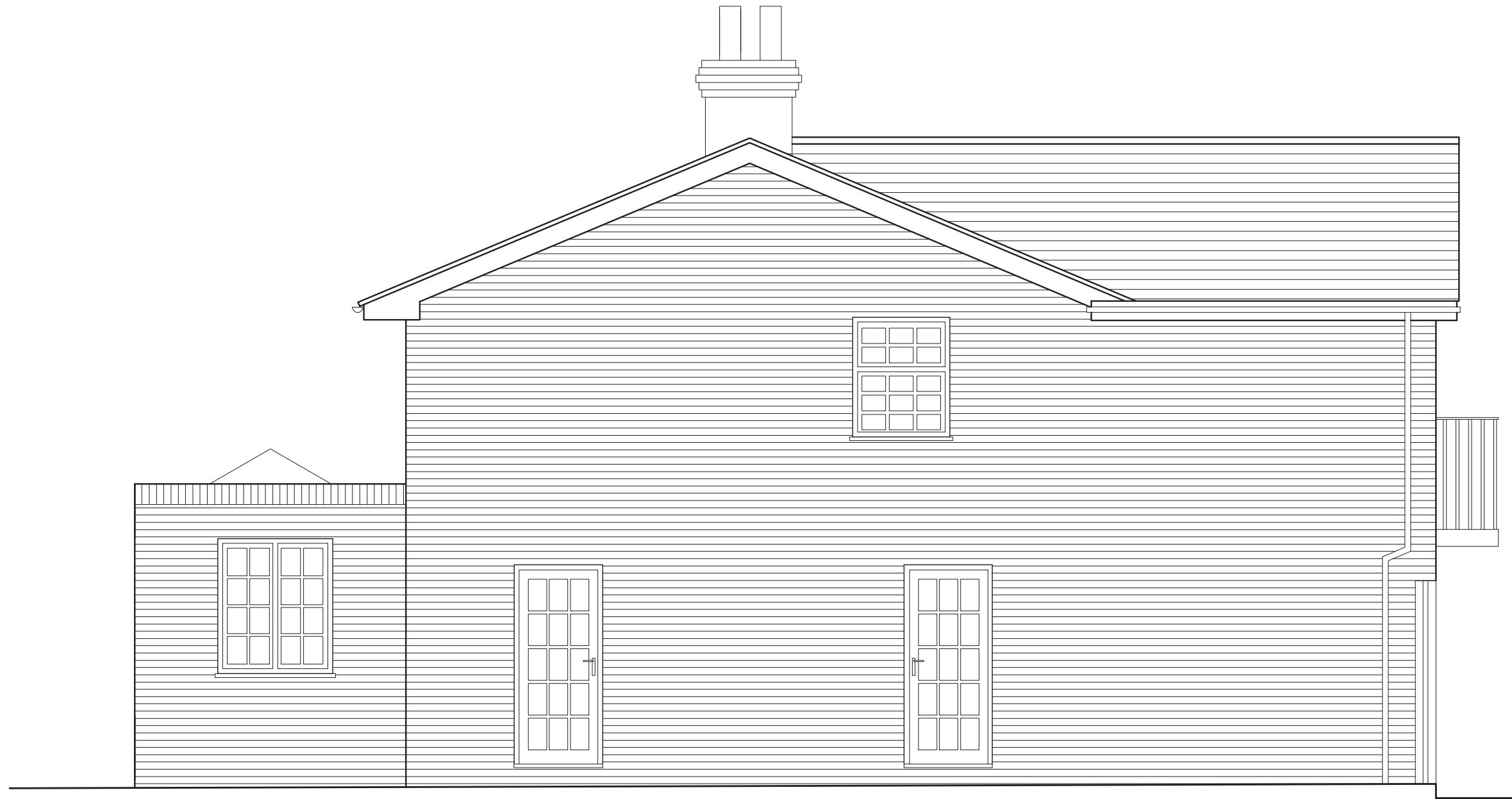
Proposed North Site Elevation