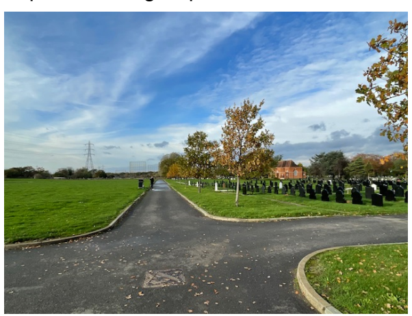
MSJC PRIMARY AND SECONDARY ROADWAY IMPROVEMENTS SEPTEMBER 2022