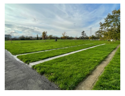
NEW LANDING BEAMS @ SECTION BX W KX AT MSJC

1.3. The review of the Memorial Safety Testing Programme (MSTP) procedure agreed between LBM Client side officers and IdverdeUK in 2021-22 has now seen all failed memorials in Section MU and M be successfully secured to land beams, these works were carried out between July-August 2022 with works carried out by monumental masons from Peace Memorials (New Malden). The