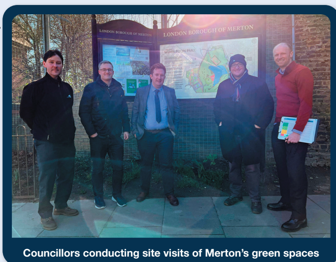
Councillors conducting site visits of Merton's green spaces

held its regular meetings with the Borough Commander to ask questions and raise matters on crime and safety.