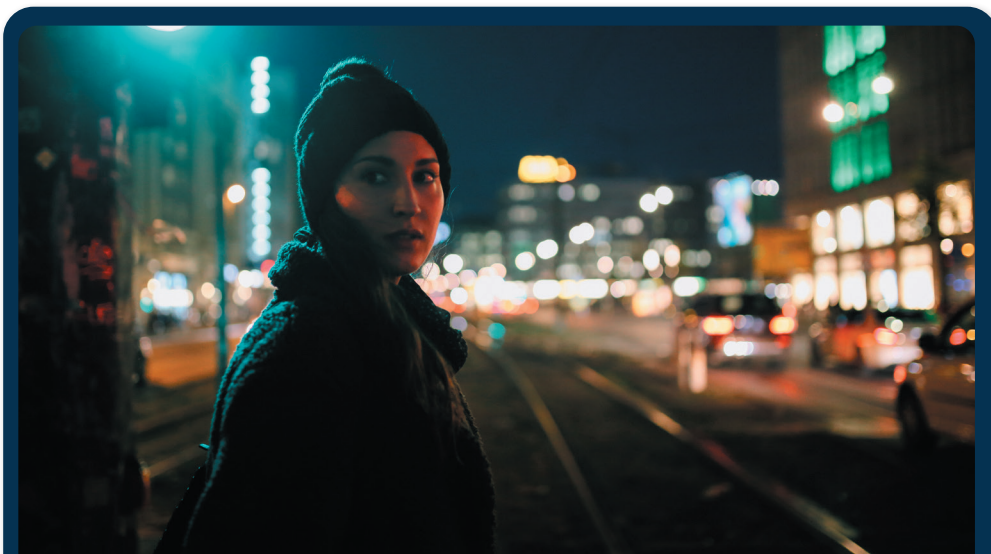
Scrutiny support Merton's commitment to improving night safety for females in the borough

The varied work of the Safer Merton team, including the extensive partnership response to violence against women and girls and the plans for additional interventions to improve safety were presented to the Overview and Scrutiny Commission, alongside attendance and additional input from the Borough Commander.