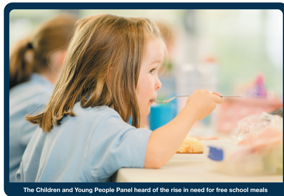
The Children and Young People Panel heard of the rise in need for free school meals

Teachers said daily briefings from the council were helpful during the pandemic. The panel were concerned that support is provided for pupils who had fallen behind during the pandemic and resolved to continue to monitor their progress.