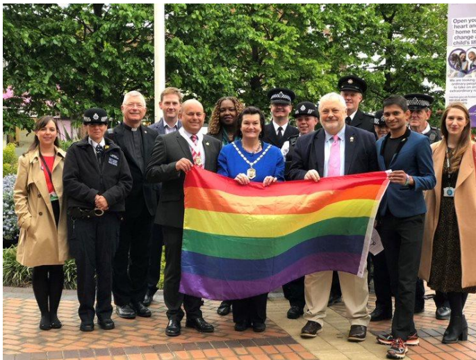
IDAHOBIT 2019, Merton Civic Centre

This important day has been marked in Merton each year since 2017, with a rainbow flag raising ceremony attended by police and partner organisations to show solidarity with our LGBTQ+ residents and encourage those who have become victims of hate crime and intolerance to come forward and get the support they need.