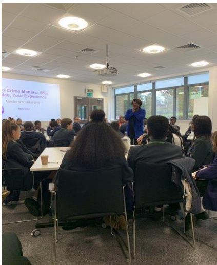
'Hate Crime: Your Voice, Your Experience Matters' event for students at Merton College, October 2019

In 2021 the launch event focused on a panel of speakers discussing the national theme of Transgender hate crime. This was combined with a session focusing on working together against race hate crime, a coffee morning with the Polish Family Association and an engagement stall at the Baitul Futuh Mosque, Morden.