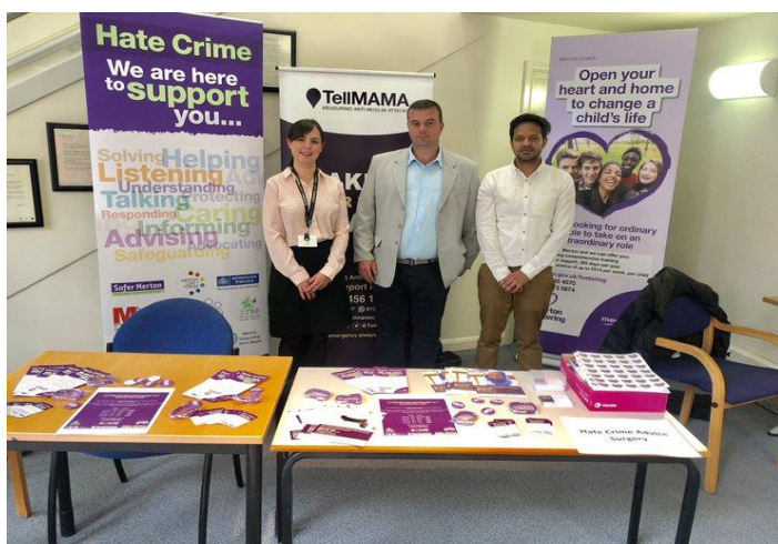
Merton Hate Crime Advice Surgery, Merton Civic Centre

In 2019 Merton became the first borough in south London to host a monthly Hate Crime Advice Surgery, in partnership with Tell MAMA and other community organisations working with victims covering each strand of hate crime. The surgeries are a confidential drop-in service for victims of hate crime to be offered advice and support.