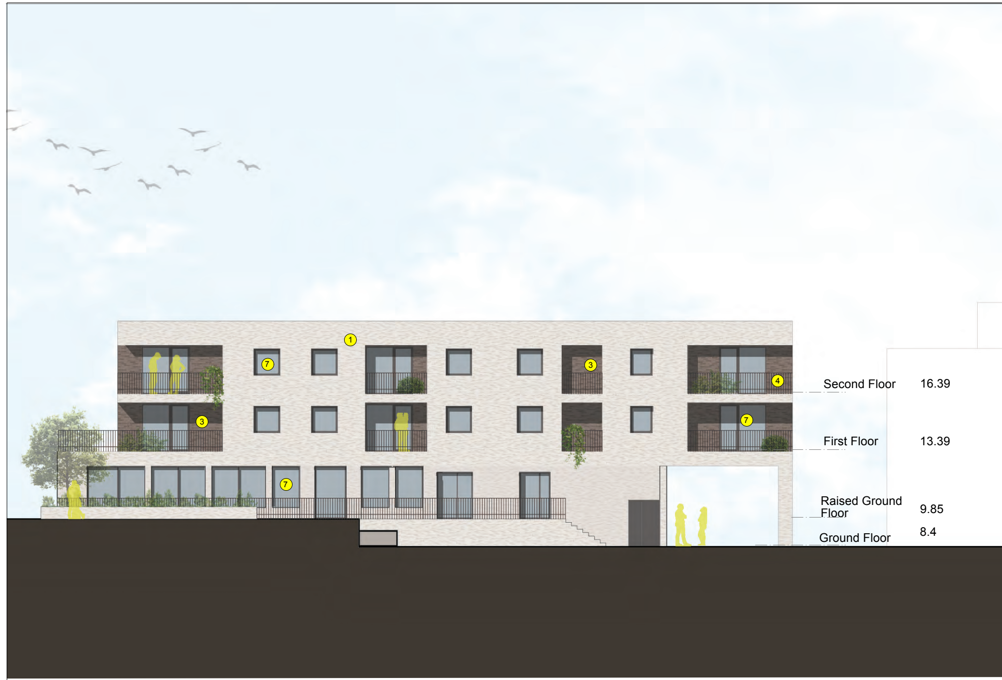
Core D Elevation scale 1:200@A3