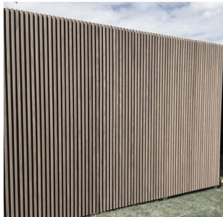
TIMBER SLAT FENCE & GATE