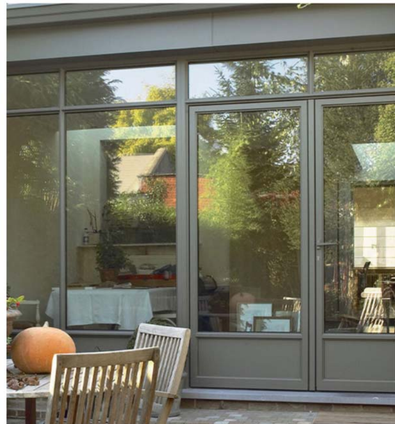
POWER COATED OR ANODISED ALUMINIUM FRAME WINDOWS, DOORS, FASCIA, HOPPER & DOWNPIPE