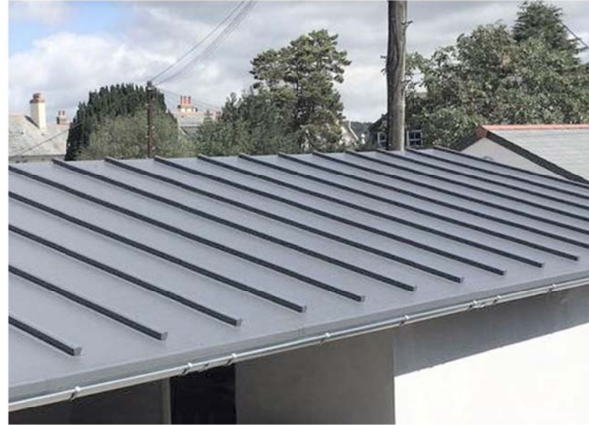
BATTEN ROLL SINGLE PLY ROOF