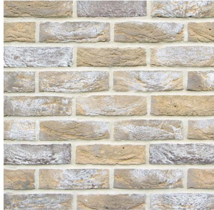
LONDON STOCK / BUFF-GREY BRICKWORK