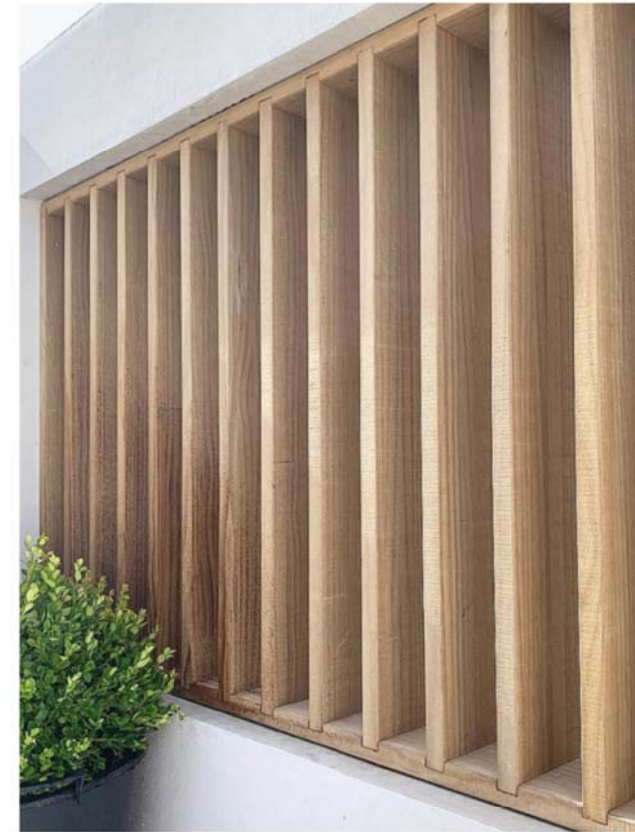
TIMBER FRAME AND FINIS TO CLERESTORY WINDOW