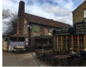
2. Colour House at Merton Library's Print Works