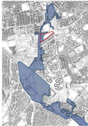
The wider Wandle Valley conservation area within Merton