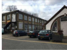
3. Locally listed buildings to the south heritage area