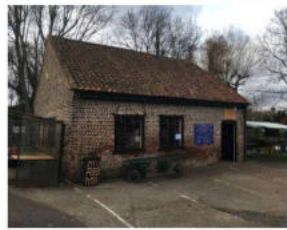
1. The Salvation Army Mothers' Hospital

The site is near, but not within, the Wandle Valley Conservation Area. The Wandle Valley is predominately an area of natural beauty and biodiversity but also encompasses heritage assets including Merton Abbey Mills.