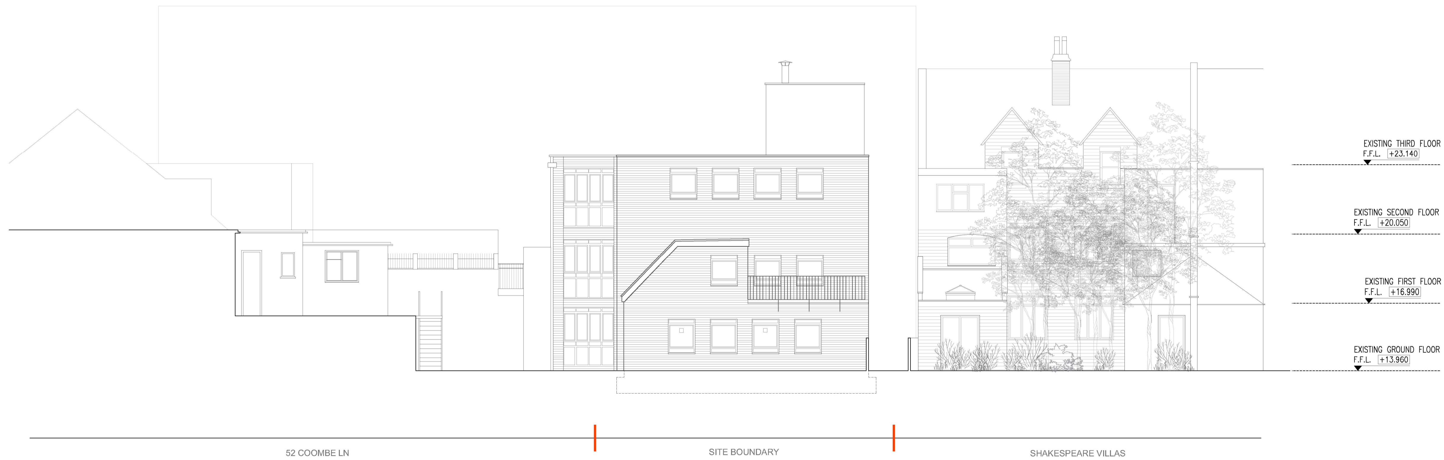
02 East Elevation 1:100@A1

notes Copyright : the copyright of this drawing is vested in Fraser Brown MacKenna Architects Ltd. It shall not be used without permission by anyone for any purpose. Do not scale drawings - use figured dimensions only. All dimensions to be verified and checked on site. Read the drawing in conjunction with all related drawings and specifications. Notify architect immediately of any discrepancy found therein.