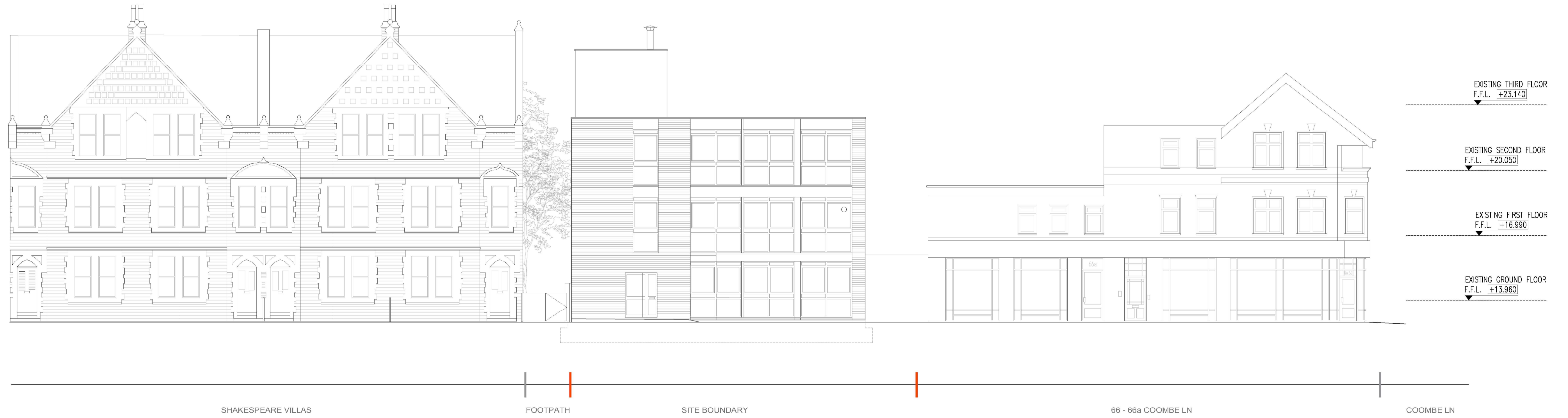
01 West Elevation 1:100@A1