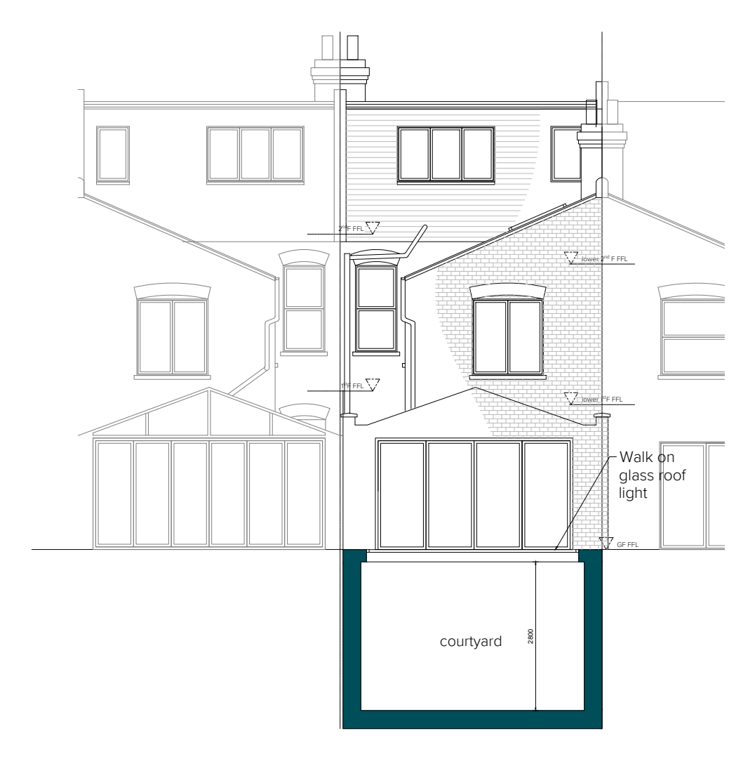
PROPOSED SECTION F-F