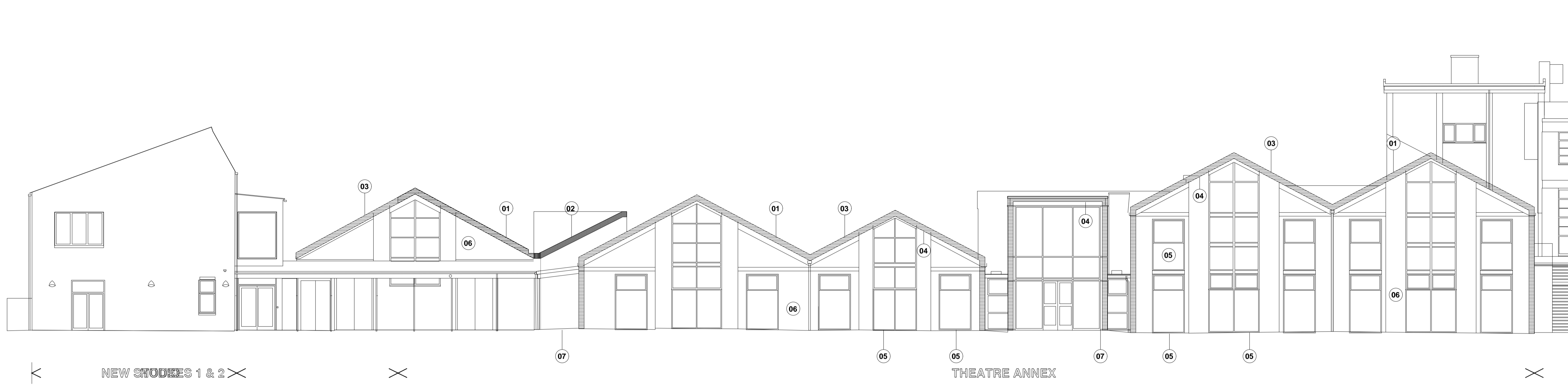
1 Theatre Annex - Elevation A 1.125