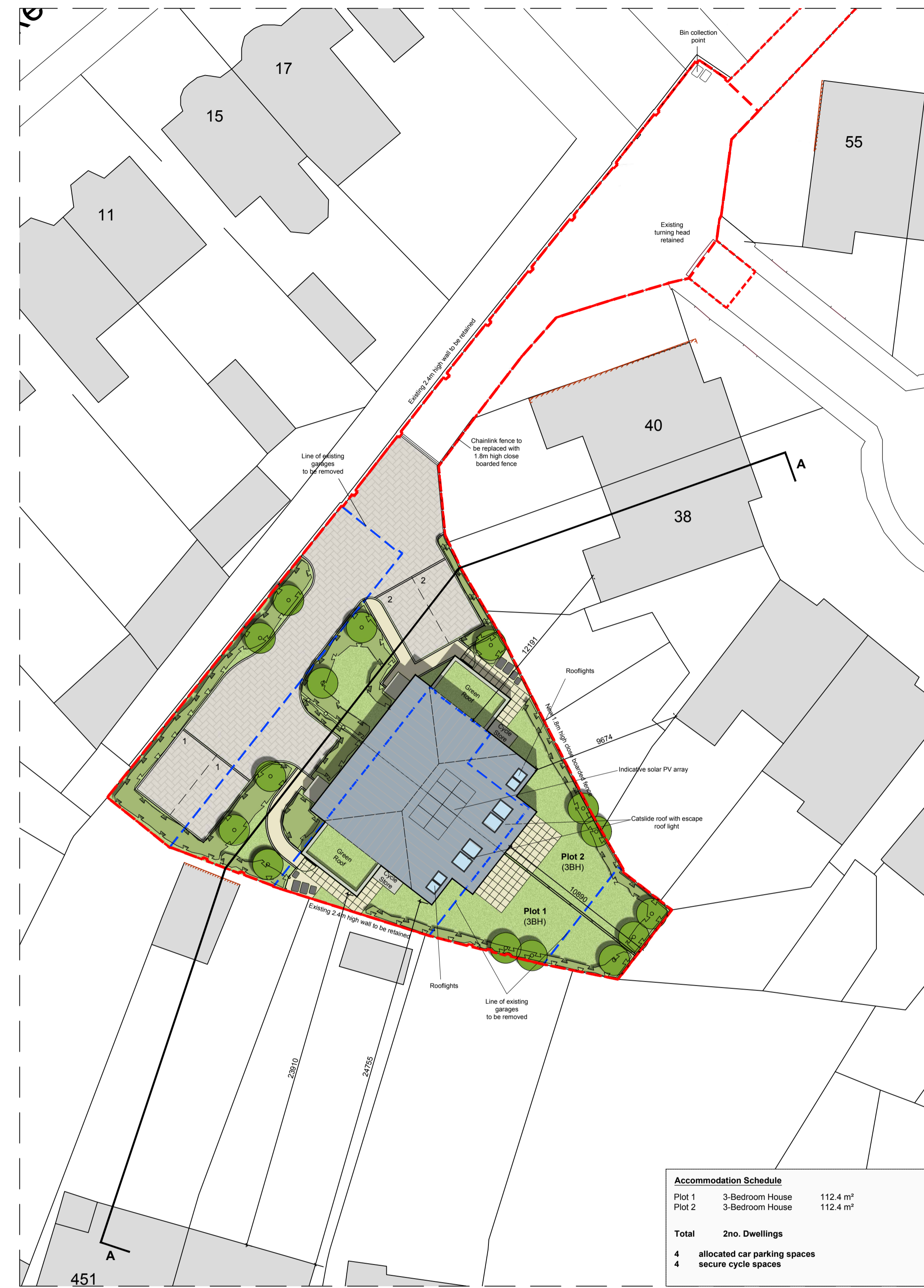
Proposed Site Layout