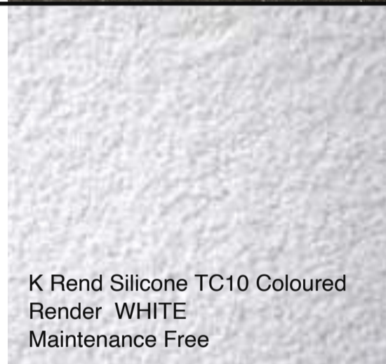
K Rend Silicone TC10 Coloured Render WHITE Maintenance Free