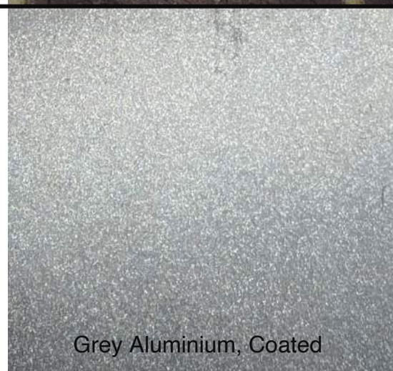
Grey Aluminium, Coated