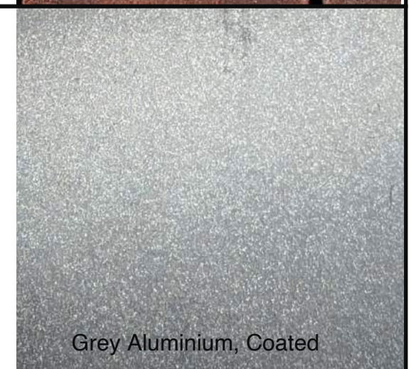
Grey Aluminium, Coated