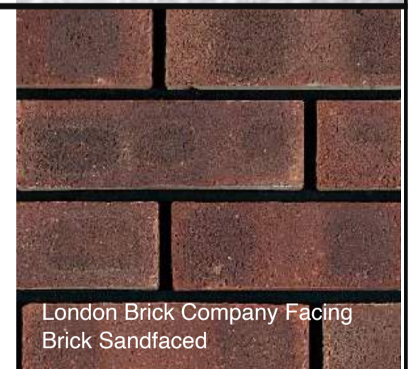
London Brick Company Facing Brick Sandfaced