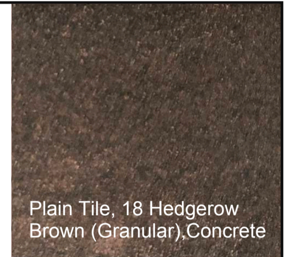
Plain Tile, 18 Hedgerow Brown (Granular), Concrete