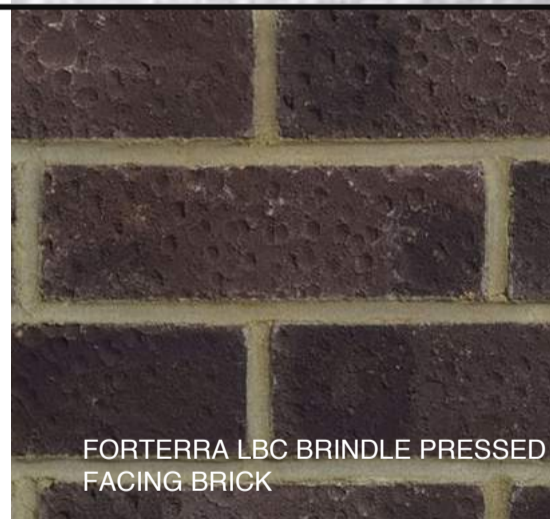
FORTERRA LBC BRINDLE PRESSED FACING BRICK