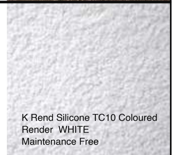
K Rend Silicone TC10 Coloured Render WHITE Maintenance Free