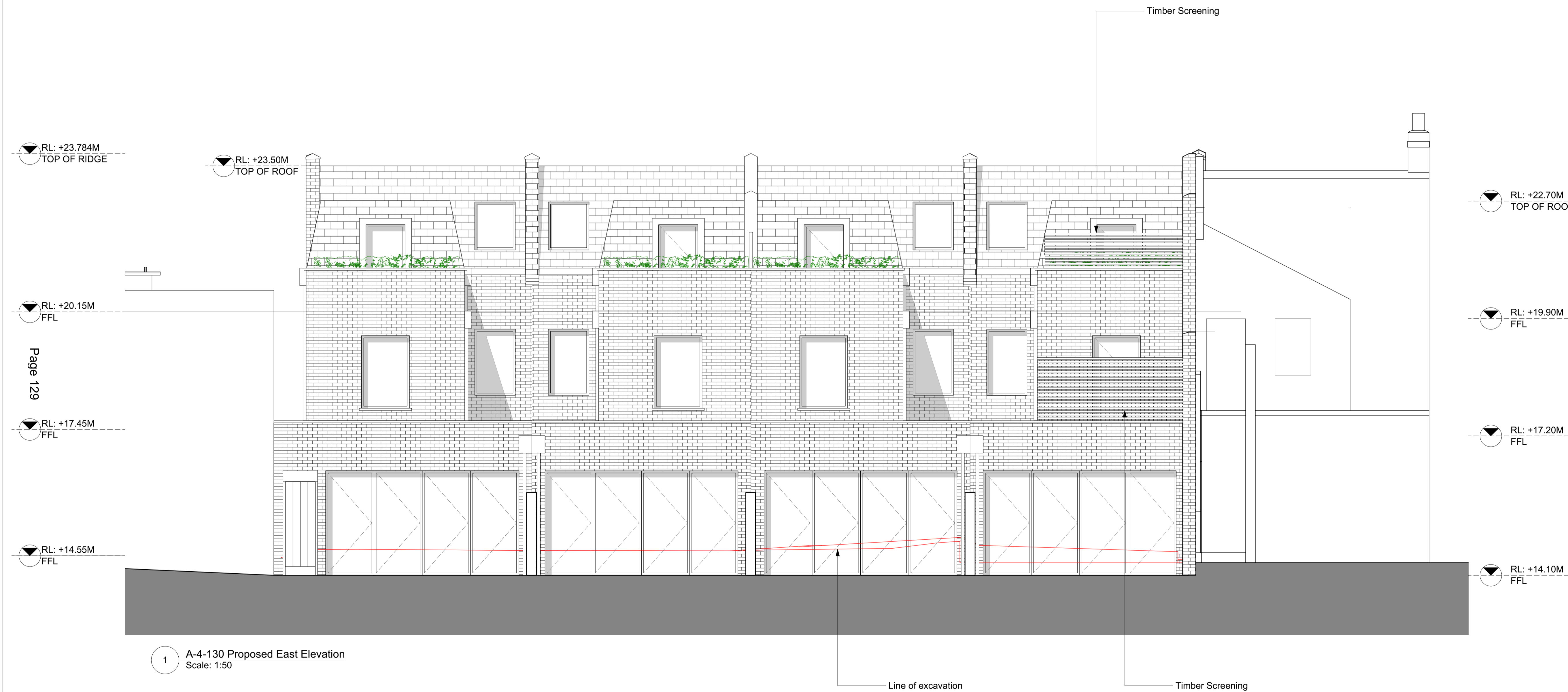
1 A-4-130 Proposed East Elevation Scale: 1:50

All illustrated material is subject to copyright unless otherwise agreed in writing. This document must be read for the express purpose and project for which it has been created and delivered and must be read with relevant specification clauses.