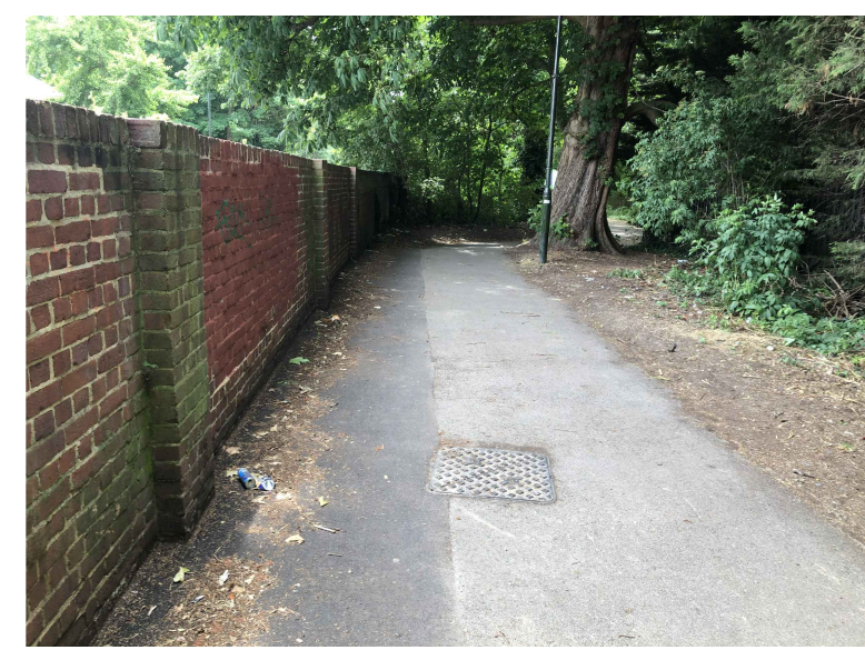
EXISTING SHARED USE PATH SHOWING WALL TO BE REMOVED AND EXISTING LAMP POST