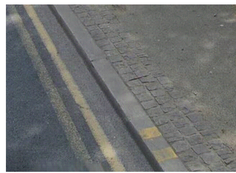
PROPOSED STONE SETTS SURFACE FOR HARD VERGE