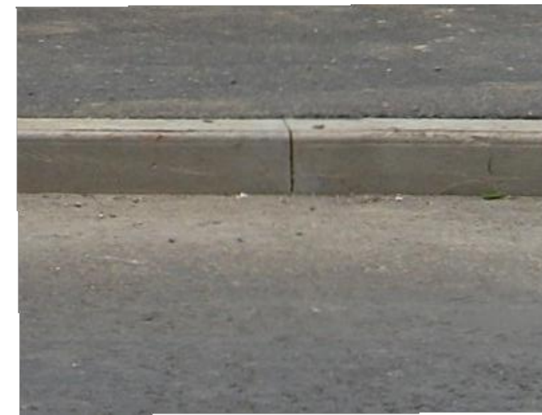
PROPOSED KERB COLOUR SWATCH