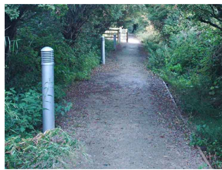
PROPOSED ADDITIONAL LOW LEVEL LIGHTING (IF REQUIRED)