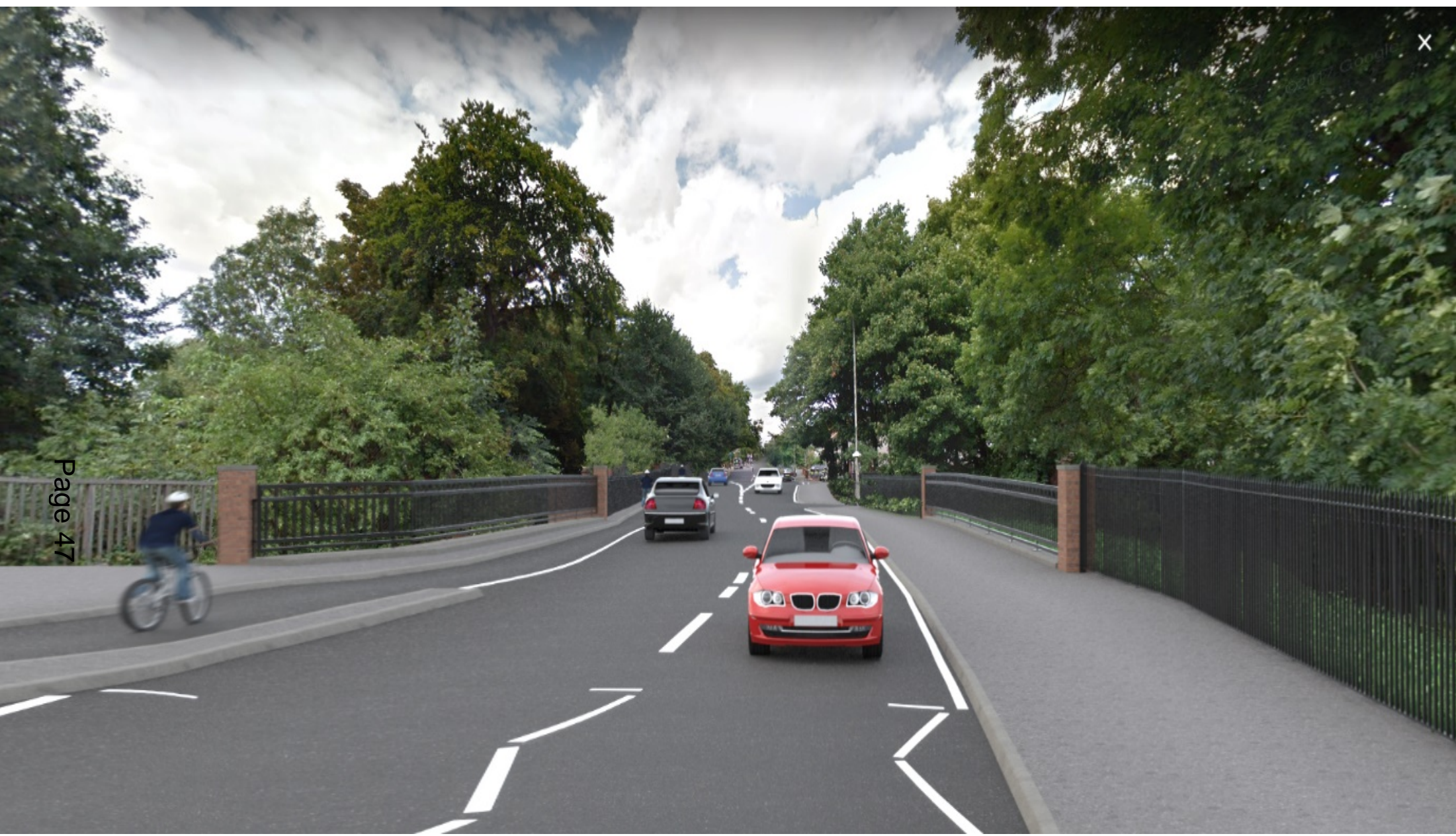
Image view of new bridge looking north (towards Mitcham town centre).