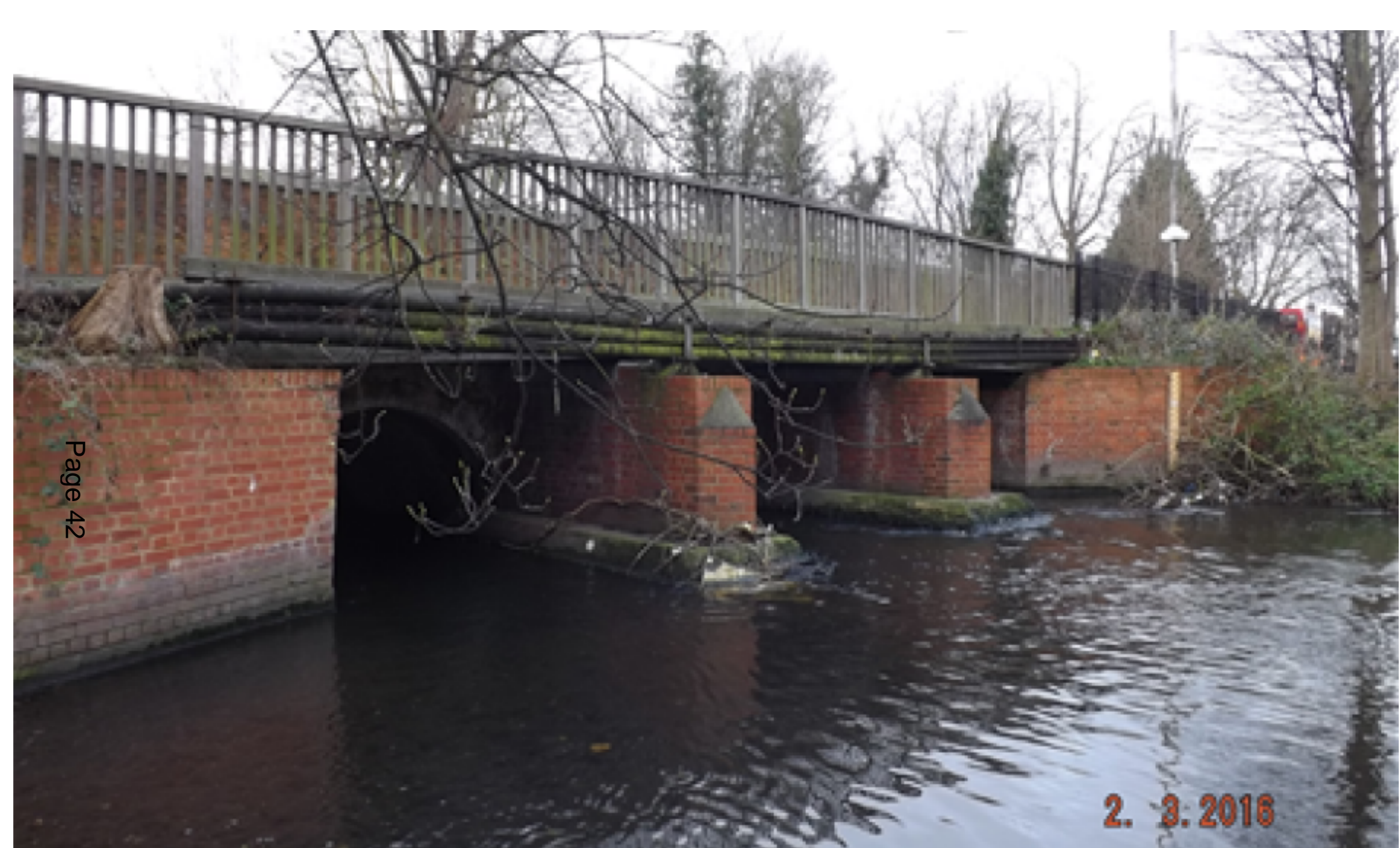
Photo of the former bridge, viewed from upstream / south eastern riverbank (National Trust Land).