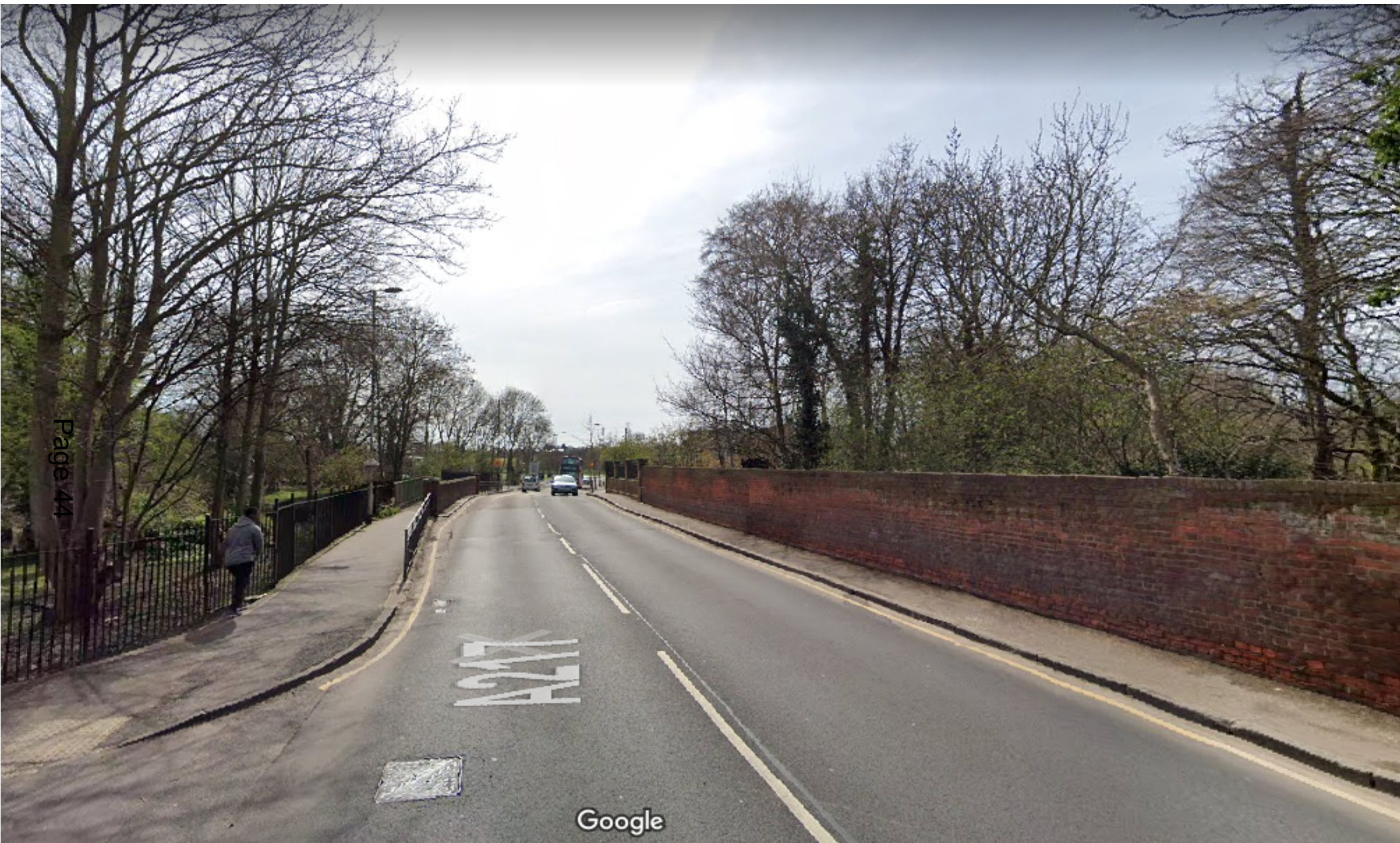
View southbound (Google maps April 2018). Watermeads Nature Reserve to left of image. Ravensbury Park to the right.