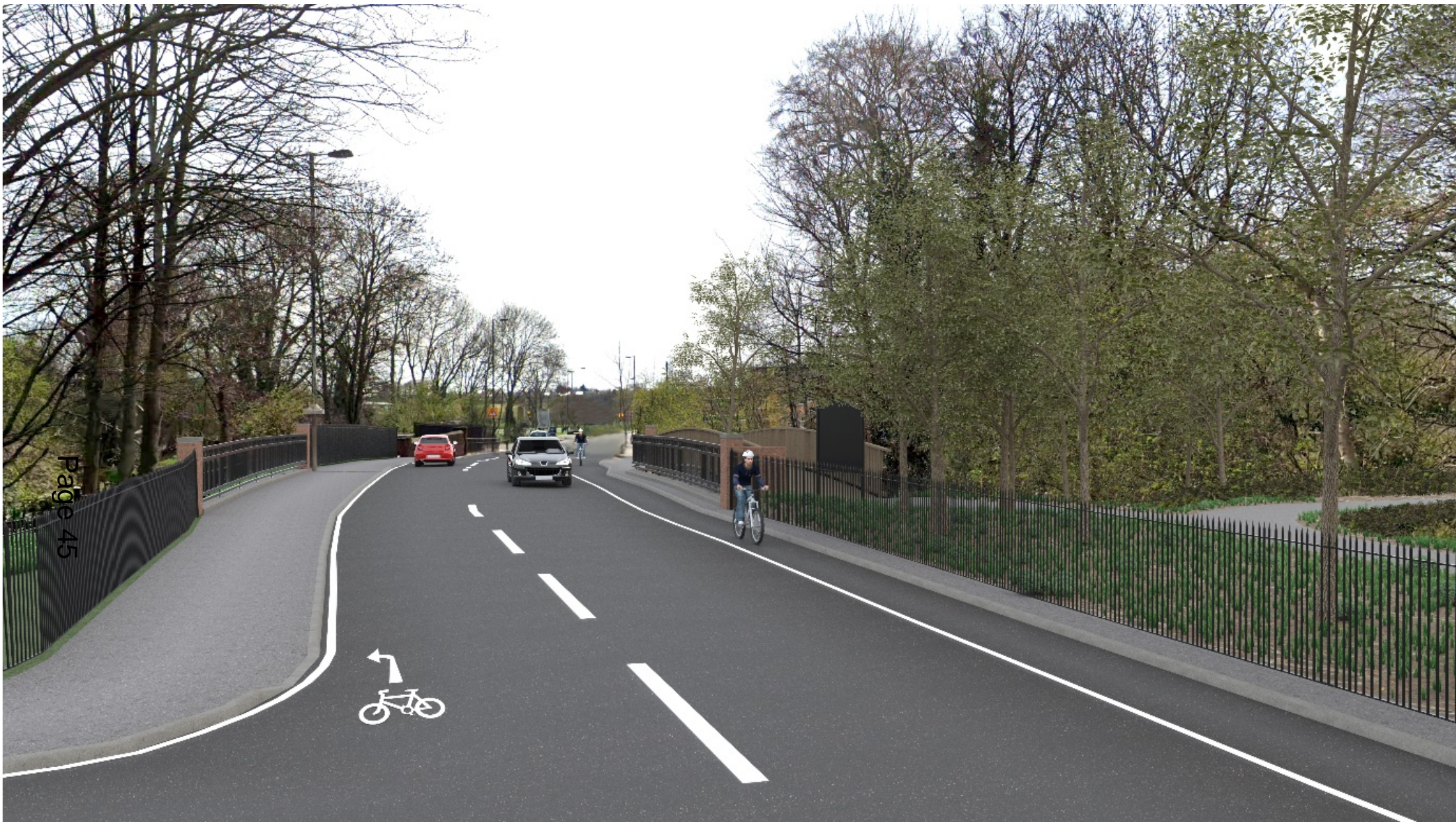
View southbound on new bridge. Watermeads Nature Reserve to left of image. Ravensbury Park to the right.