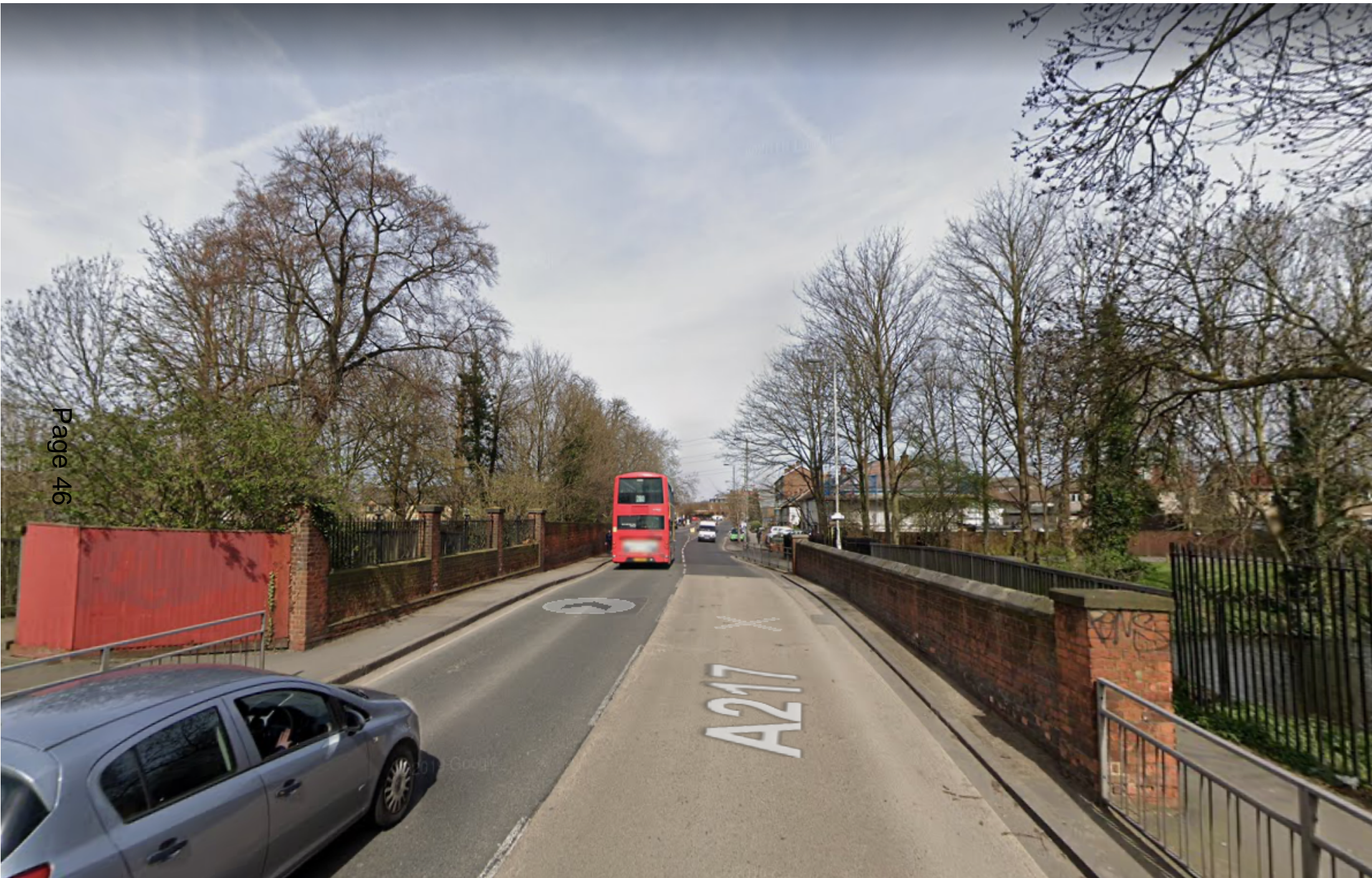
Image of the former bridge, looking north towards Mitcham town centre.