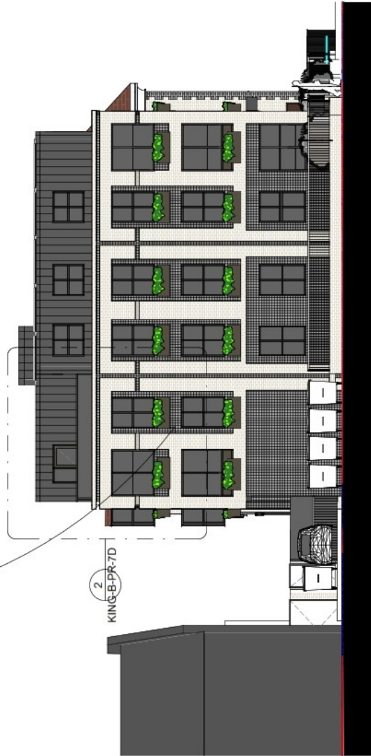
1 SIDE (BRISBANE RD) 1 : 100

For details of Brick relief pattern please see KING-PR-4.6.