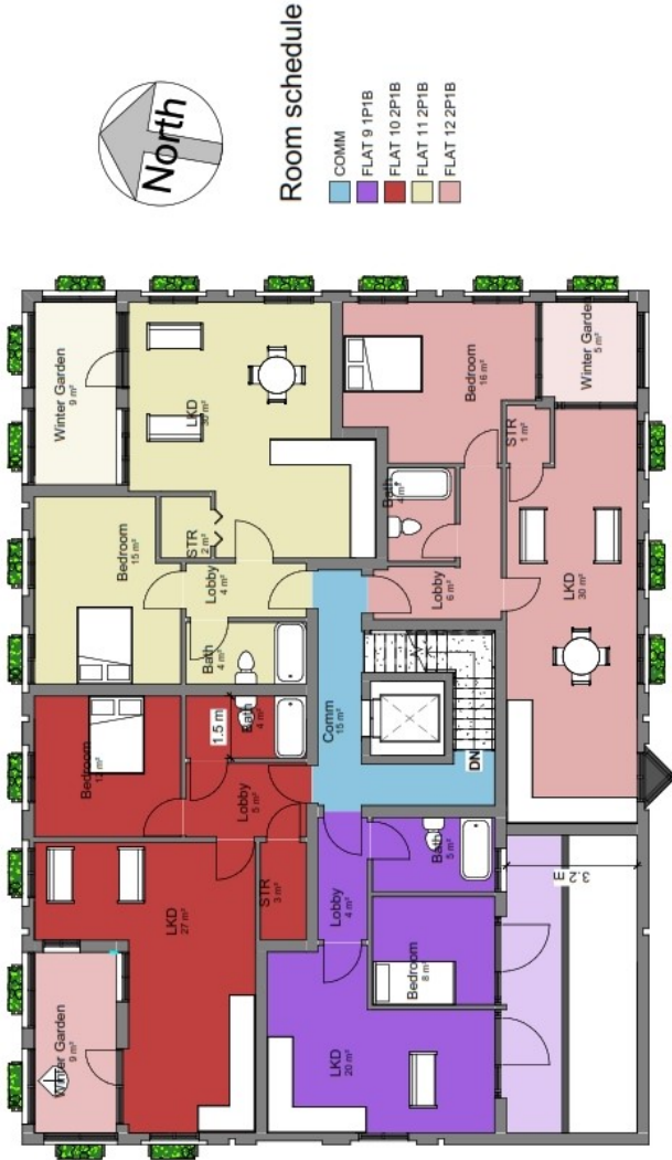
1 NB. 2nd floor 1 : 100

These drawings are for use in the planning process only. All measurements should be checked on site. These plans should not be used for structural calculations or any other engineering purpose.