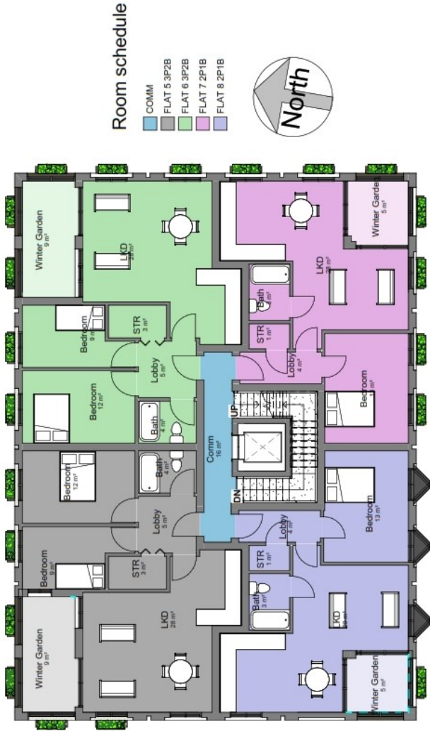
1 NB 1st Floor 1 : 100

These drawings are for use in the planning process only. All measurements should be checked on site. These plans should not be used for structural calculations or any other engineering purpose.