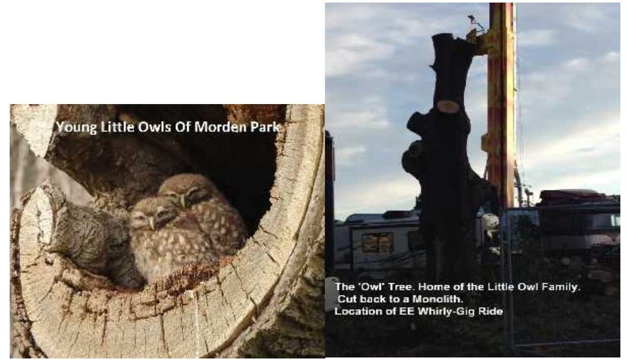
As I had been observing these birds since early season, it was apparent to me that their normal patterns of behaviour, particularly hunting to feed young,

The Impact on Wildlife and Natural Environment is an essential element to consider when license applications for 'Green Space' Events such as EE are submitted to Council... And the impact on the incumbent Morden Park wildlife, in particular the Birds that were raising young families in the trees surrounded by the festival, was considerable.