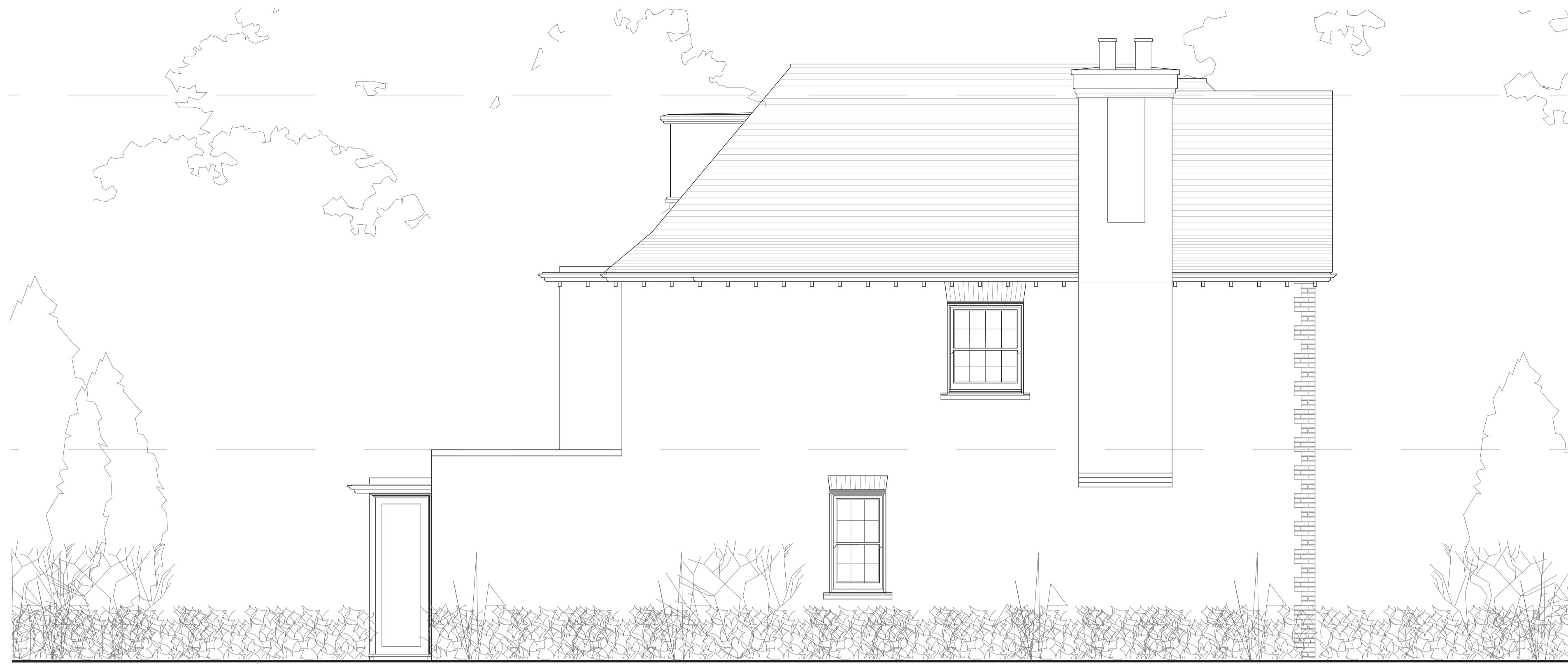
PROPOSED NORH WEST ELEVATION