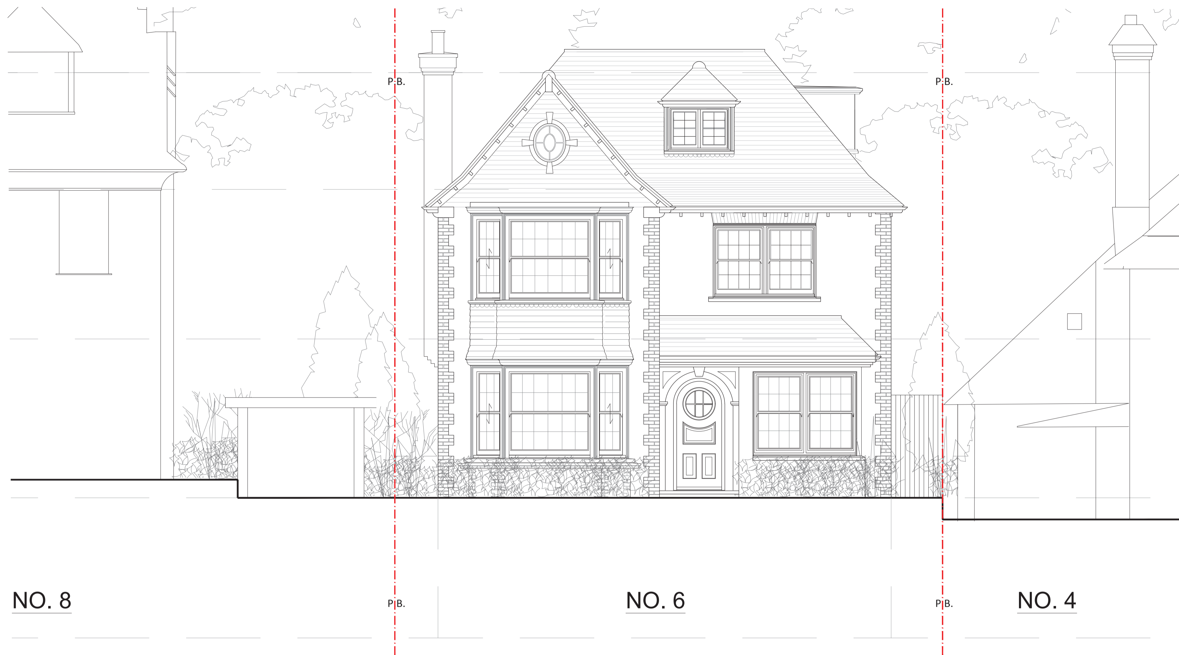
PROPOSED FRONT ELEVATION Scale 1:50 @ A1