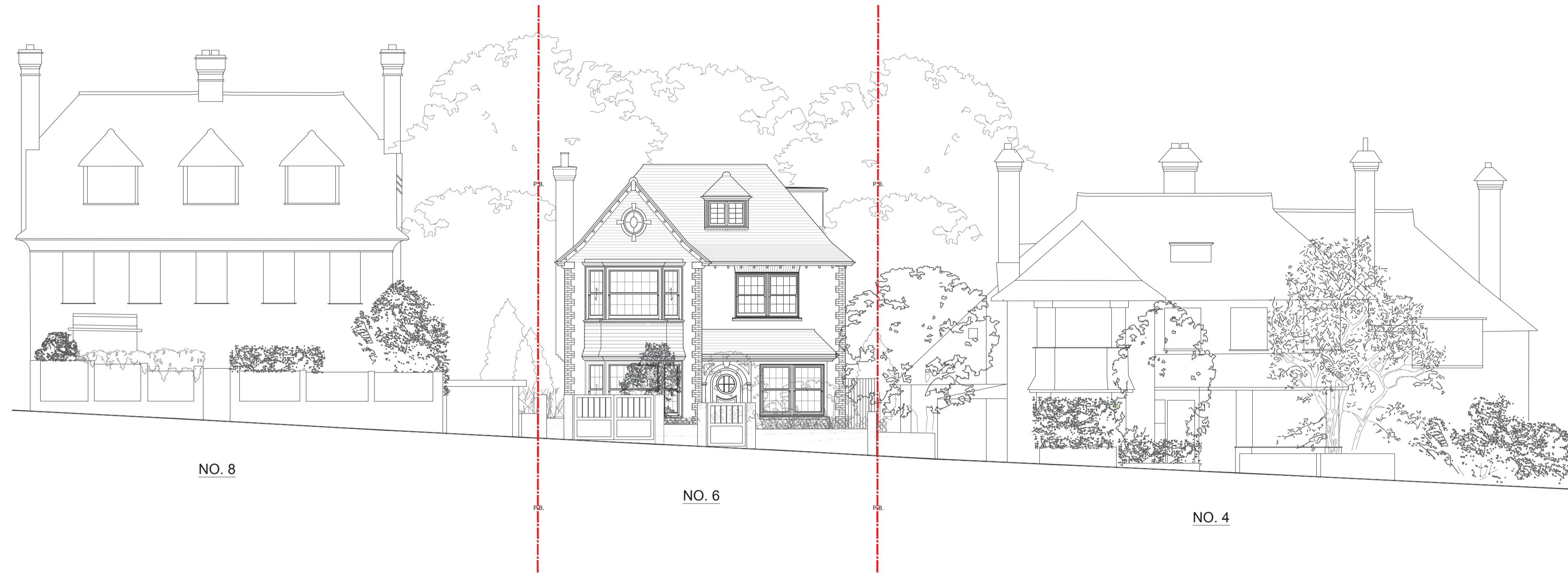
PROPOSED STREET ELEVATION Scale 1:100 @ A1