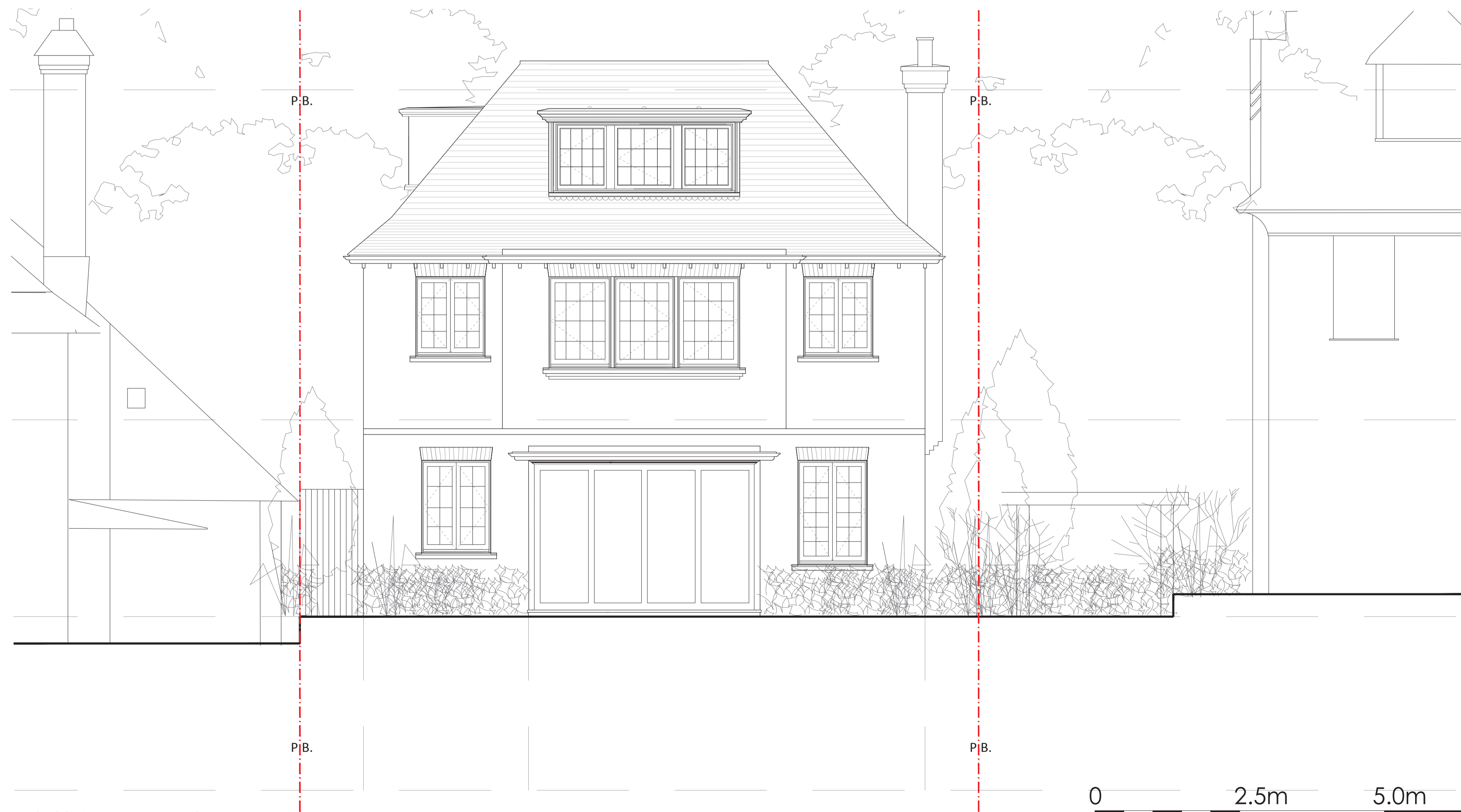
PROPOSED REAR ELEVATION Scale 1:50 @ A1