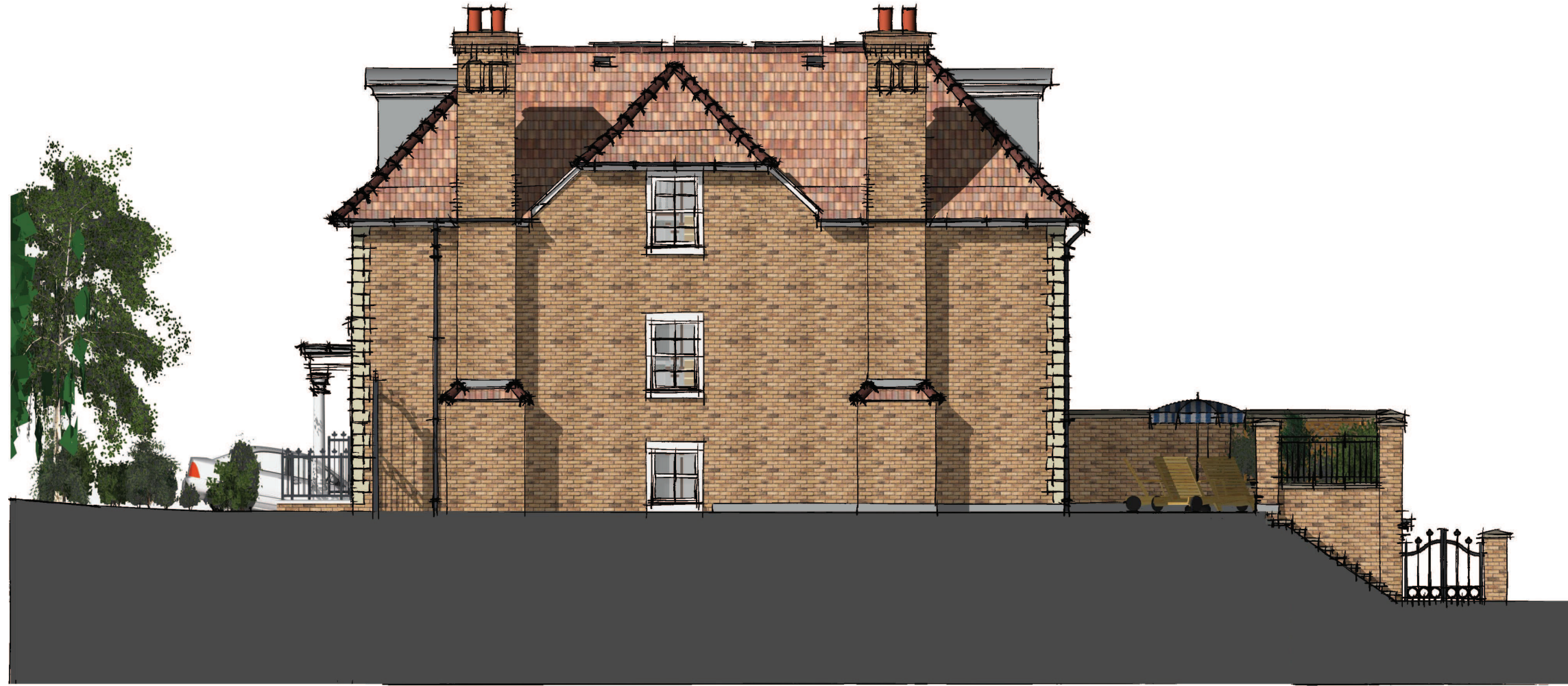
PLOT 2 SIDE ELEVATION (NORTH)