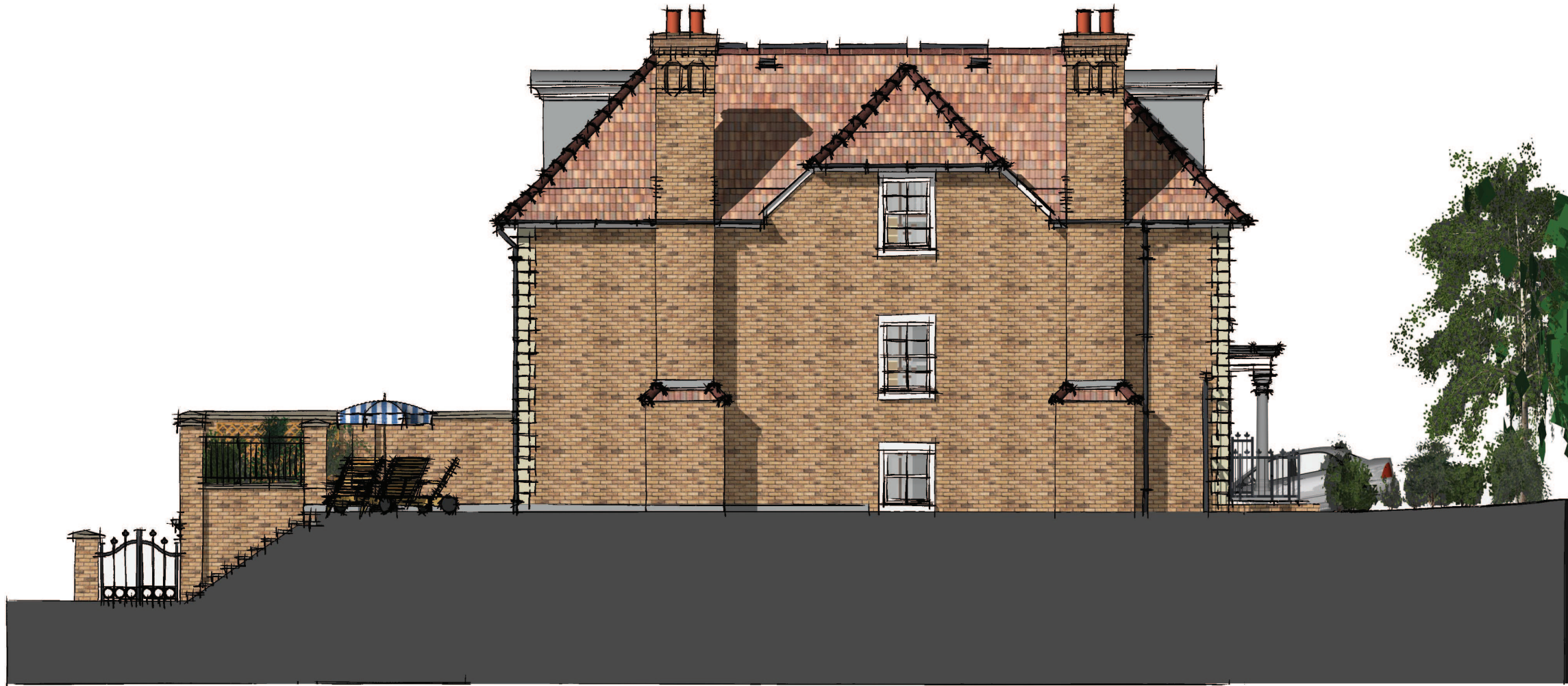
PLOT 1 SIDE ELEVATION (SOUTH)