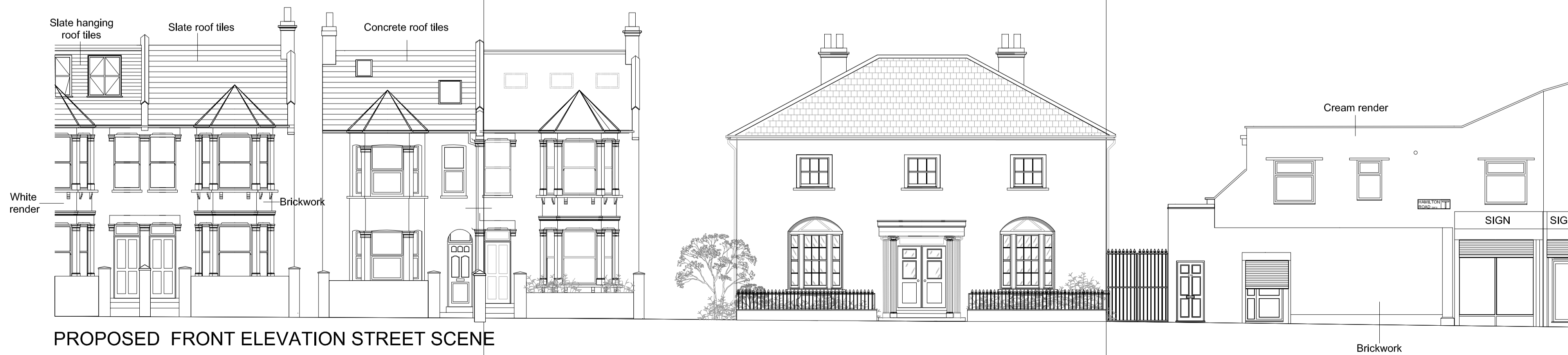
PROPOSED FRONT ELEVATION STREET SCENE