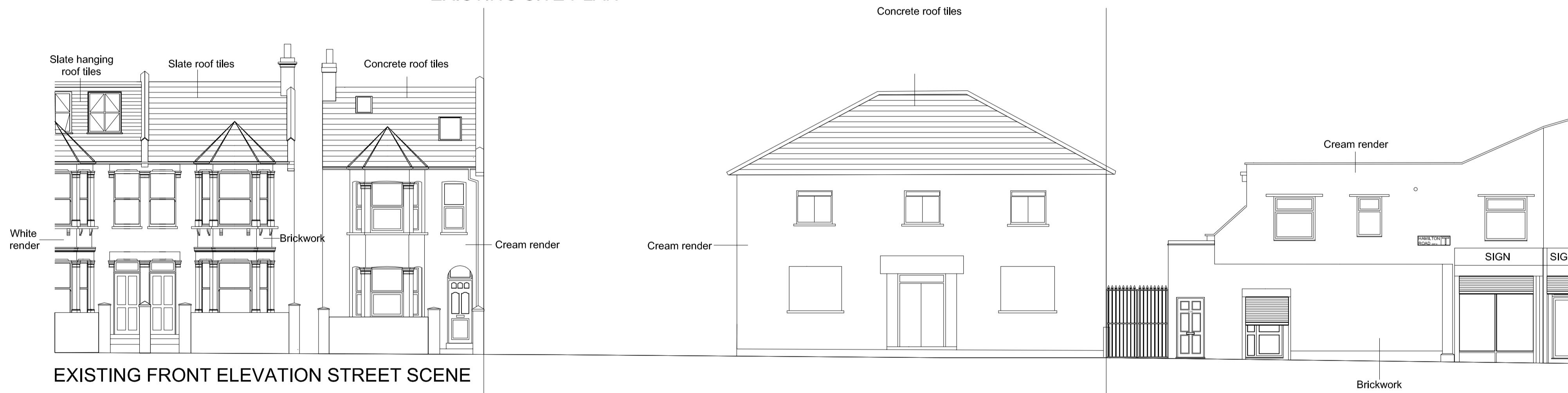
EXISTING FRONT ELEVATION STREET SCENE